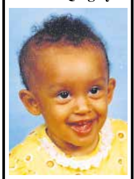
Happy 18th Birthday 1st October 2017 AKA CFH Enjoy !!! Love you forever Mum and Dad xxxxx