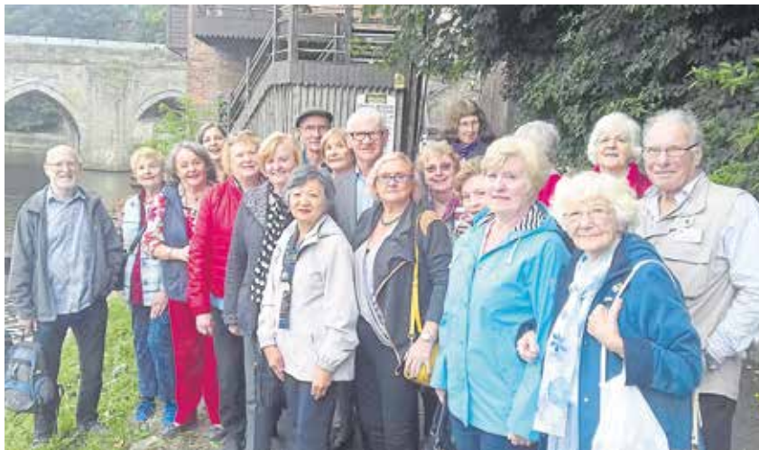
Hosts, County Durham Friendship Force International with the visiting group of ambassadors from Sydney, Australia.