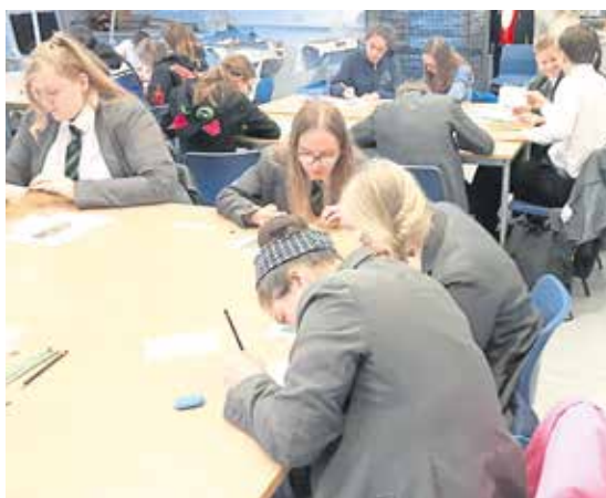
Woodham Academy students visited Darlington College and Queen Elizabeth Sixth Form College

Year 10 students at Woodham Academy were recently given the opportunity to visit Queen Elizabeth Sixth Form College and Darlington College as part of the school's enrichment programme. This aims to give students an insight into life after leaving school and the various options they have available.