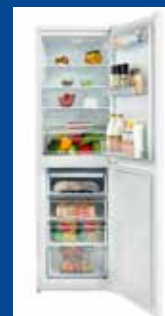
CCFH1582W 182cm tall, 54.5cm wide 60cm deep