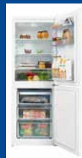
CCFH1552W 152cm tall, 54.5cm wide 60cm deep