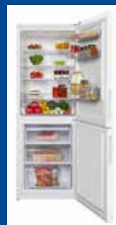
CCFH1675W 175cm tall, 60cm wide 60cm deep