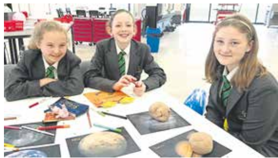
Eleven Year 7 girls from Woodham Academy attended