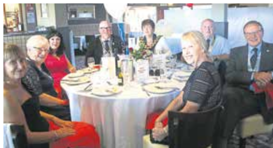
Top Table guests of the President