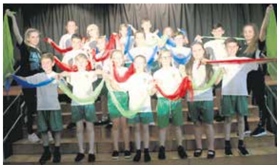
Sugar Hill Dance Group Primary Music Ensemble Ed Sheeran Medley