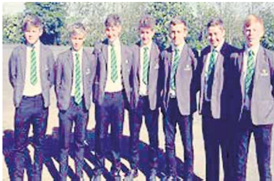
Team of the year Year 9 Boys Rugby Team