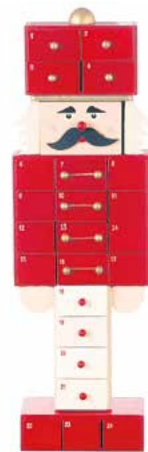
Soldier - Dimensions: 53x34cm - £32.55