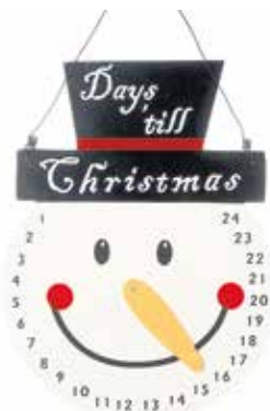
Snowman - Dimensions: 22.5x1x29.5cm - £7.55