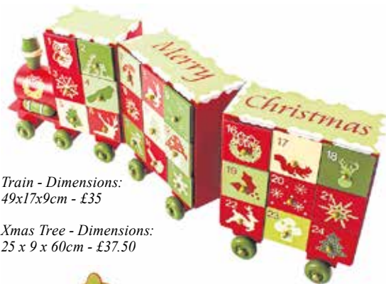
Train - Dimensions: 49x17x9cm - £35

classic snowman in a black top hat would look great hanging on any wall used as a calendar or even just a decoration.