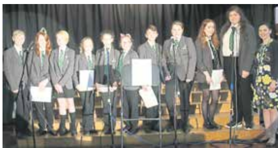
Woodham Sound: "Riptide"