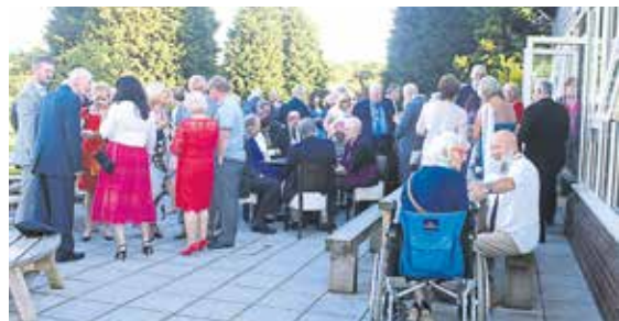
Pre-Dinner drinks were enjoyed on the patio overlooking the Woodham Golf Course