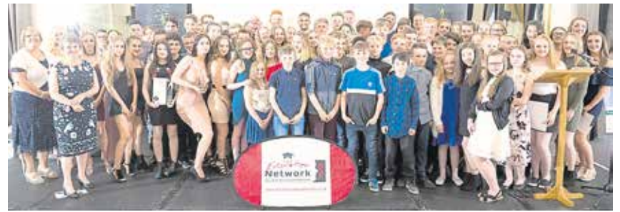
Sports Academy Nominees

opportunities, Woodham Academy gives students the chance to progress in a huge range of sports. All of the staff are extremely proud of how far the students have come and how sport has a positive effect on their school work and behaviour. On average, the students are a part of the Sports Academy and perform better academically than others. The Presentation Evening was a fantastic night enjoyed by all.