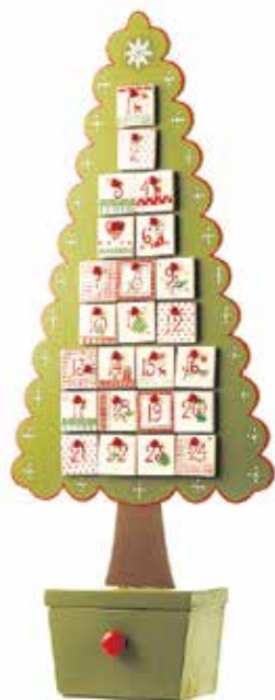
Xmas Tree - Dimensions: 25 x 9 x 60cm - £37.50