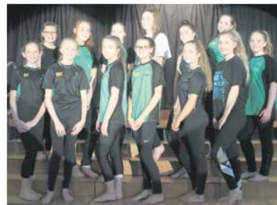
Woodham Dance Academy: "There Will Be Time"