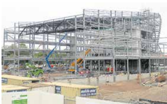
Finley Structures' steelwork going up in Hull

As well as fabricating and erecting the steel for the multi-use complex, Finley Structures is also installing pre-cast concrete stairs, lift shafts and terrace units. The Aycliffe firm is on site