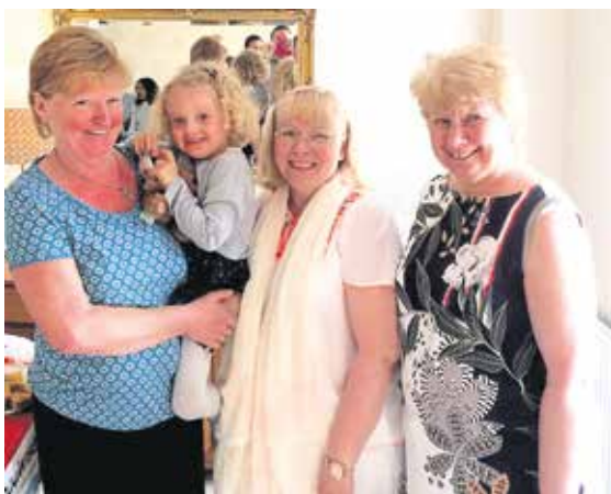
Coffee Morning organisers raised £1000

With the total raised now standing at £26,837, Paul has