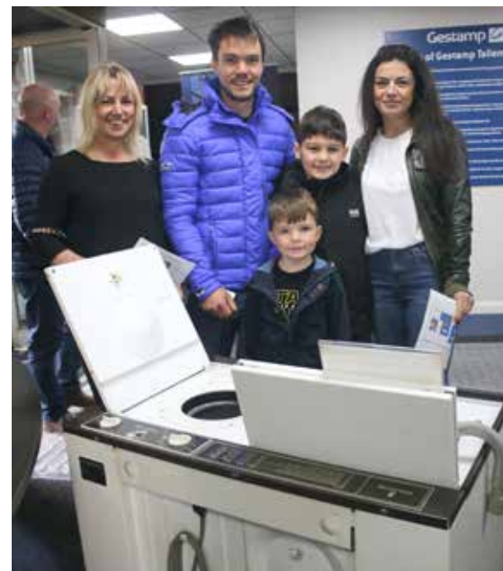
Visitors saw what Tallent's first produced at Aycliffe in the mid 1950's - the Colston Washing Machine.