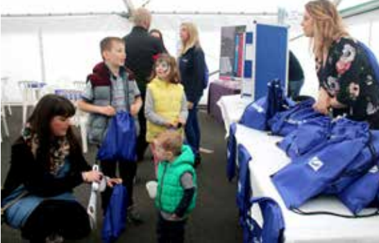
Goody Bags for everyone