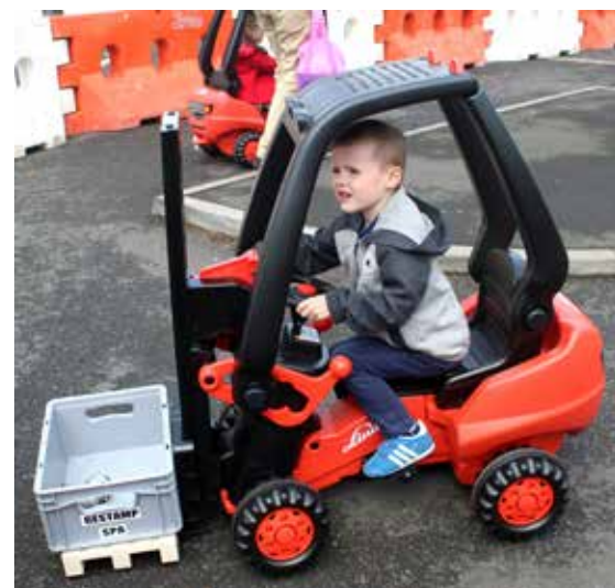
Fork lift Truck Training starts early