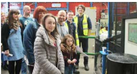
Robot Sweetie Dispenser was very popular