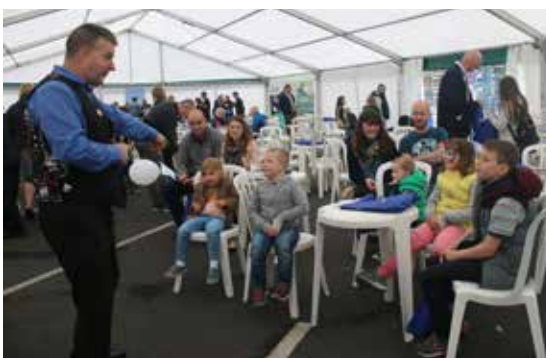
Magician entertains families in the marquee

Turnout was excellent and I extend my thanks to those people and organisations who worked hard to make the Open Day a success".