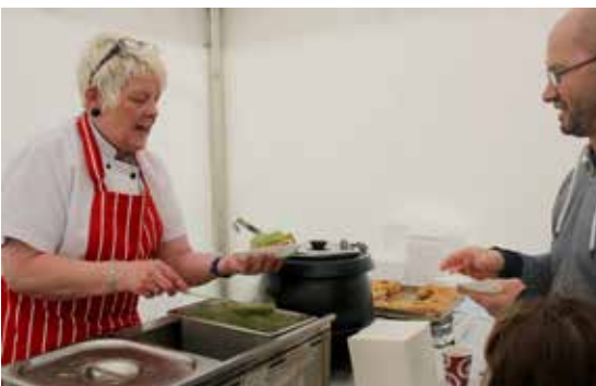
Steak Pie with Mushy Peas was part of the menu