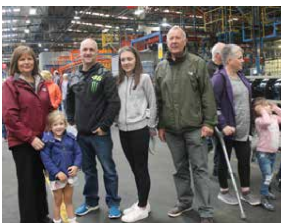
Family touring the plant

at stacking storage boxes. Local Photographers "Eye Dream" were on site taking family shots to help them remember this special day and everyone went home with a goody bag. More photos on page 6.