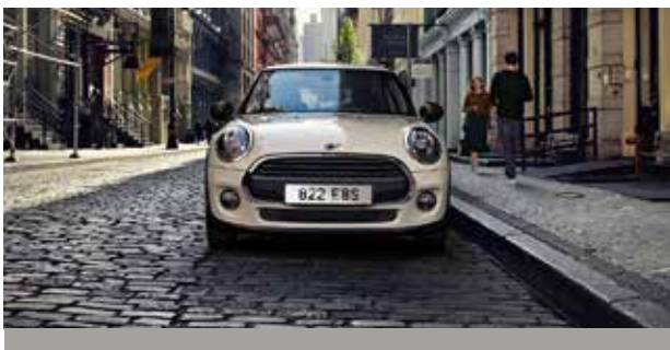
MINI ONE 3-DOOR HATCH.

Offering a range of stunning designs, at Cooper Durham there's something for everyone.