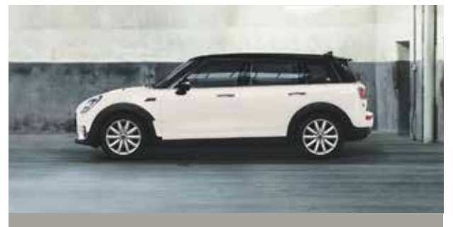
MINI ONE CLUBMAN.

Monthly payments from £199 per month + £199 initial rental 2 .