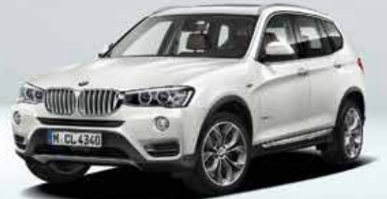
THE BMW X3 20d xLINE.