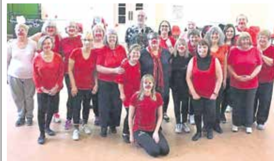
The Dance-Fit Group at Neville Parade Methodist Church ready for Red Nose Day.