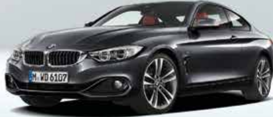
THE BMW 420i SPORT COUPÉ.