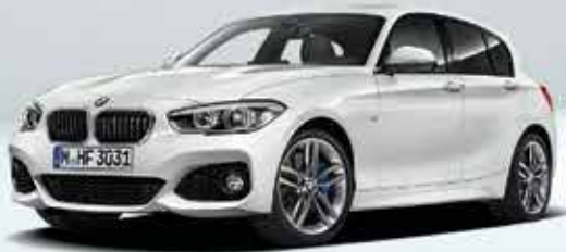
THE BMW 118i SPORT 5-DOOR.