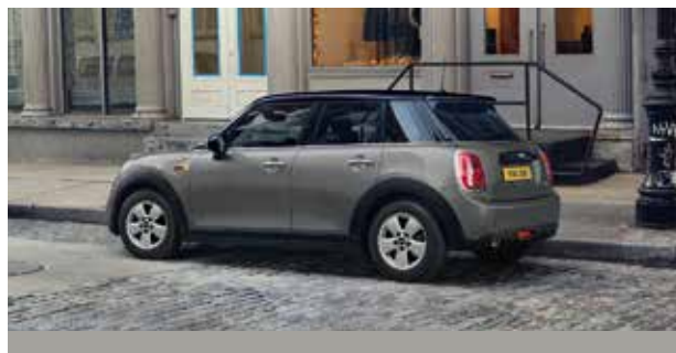
MINI ONE 5-DOOR HATCH

Monthly payments from £189 per month + £189 initial rental 1 .