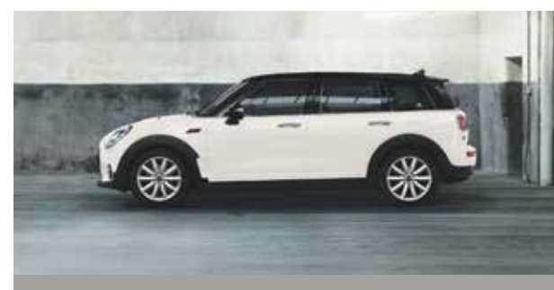
MINI ONE CLUBMAN.

Monthly payments from £199 per month + £199 initial rental 2 .