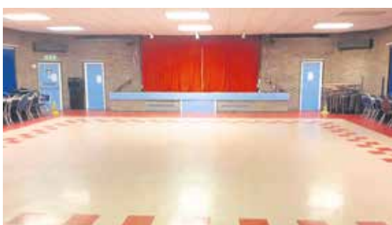
Neville Parade Centre's large Hall with stage, smaller dining/meeting area with kitchen available