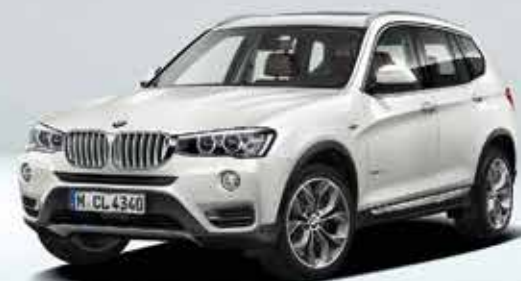
THE BMW X3 20d xLINE.