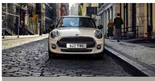
MINI ONE 3-DOOR HATCH.

Offering a range of stunning designs, at Cooper Durham there's something for everyone.