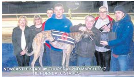
NEWCASTLE STADIUM THURSDAY 2ND MARCH 2017 THE HORNDALE STAKES