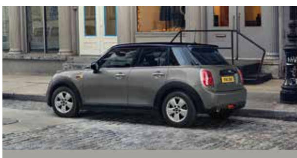
MINI ONE 5-DOOR HATCH

Monthly payments from £189 per month + £189 initial rental 1 .