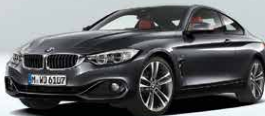
THE BMW 420i SPORT COUPÉ.