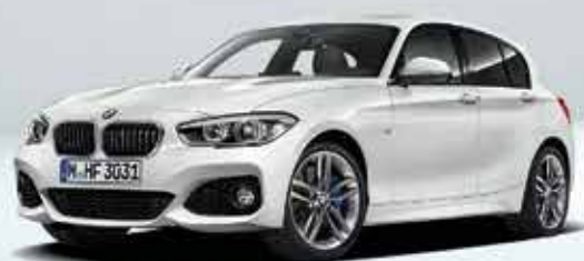
THE BMW 118i SPORT 5-DOOR.