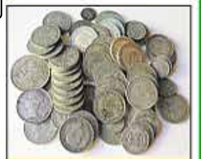
Pre 1947 Silver Coins