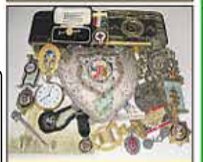
All Small Collectors Items