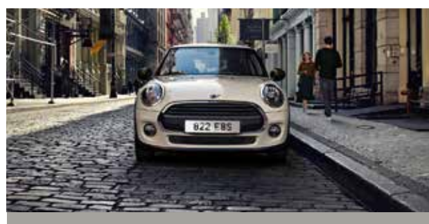
MINI ONE 3-DOOR HATCH.

Offering a range of stunning designs, at Cooper Durham there's something for everyone.