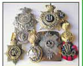
Head Dress Badges