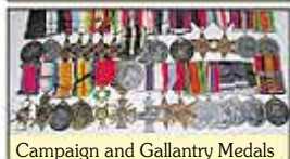
Campaign and Gallantry Medals