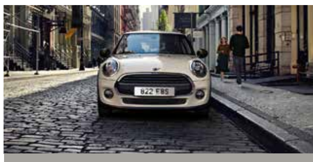
MINI ONE 3-DOOR HATCH.

Offering a range of stunning designs, at Cooper Durham there's something for everyone.