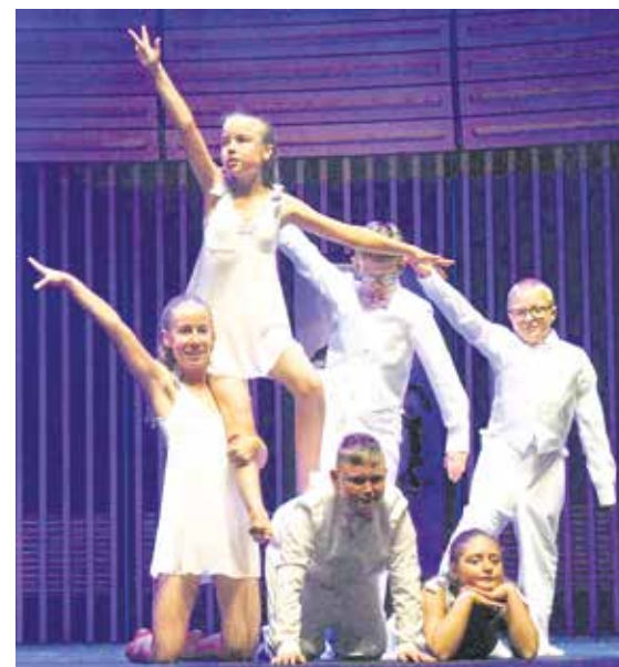
Athena reception, based

If you would like more information on this Disability Workshop or would like to book your FREE place, please contact the club by Telephone - 07928 201357 email: athenasportsacademy@gmail.com or come to the