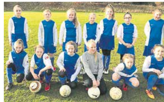
Under 12's Girls' Team