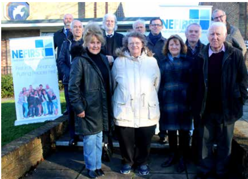
Councillors and Credit Union volunteers at St. Clare's Hall

Residents of Newton Aycliffe, Spennymoor and the East Durham Rural Corridor area are being encouraged to start saving and borrowing from their local Credit Union.