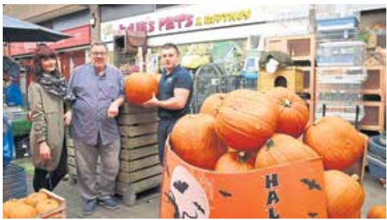
An impressive display of giant pumpkins ready for Hallowe'en at the Thames Centre Greengrocer.