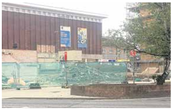
Photo shows the demolition of Churchill House almost complete, just leaving the Clock tower standing. The area where the building stood will be landscaped to reveal a new opening to the Leisure Centre and Library.