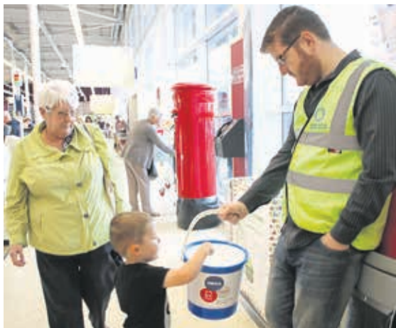
The Rotary Club helped with the charity collection