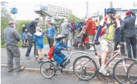
Opening of the railway pathway

Organisers of the charity fund-raising 'Railway Jaunt' planned for the two-mile stretch of new tarmac pathway beside the Newton Aycliffe to Shildon line on October 1st are reporting 'growing excitement and great interest' from runners, walkers, pedal cyclists, families and wheelchair users in various parts of the locality. The walk is one highlight of an action-packed event Museum organised by The Friends of the Stockton and Darlington Railway to commemorate