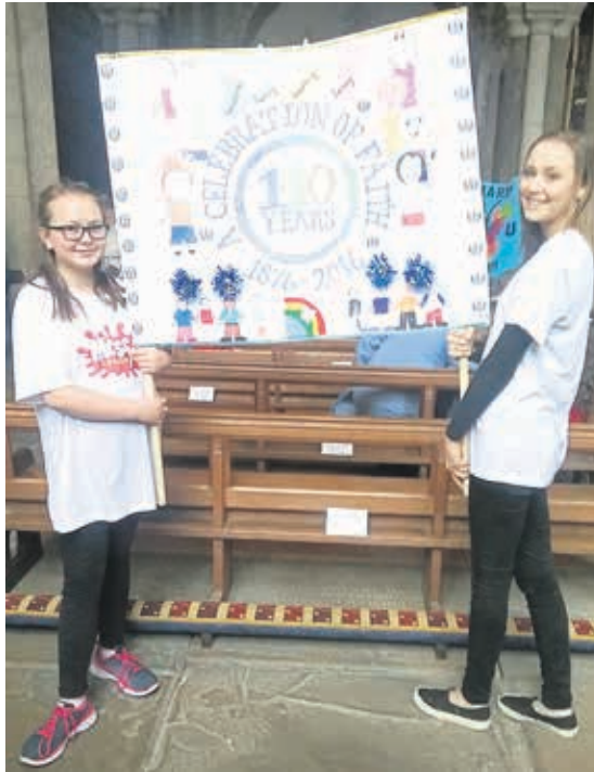
On May 31st members of Great Aycliffe Mothers' Union attended a Banner Service in Durham Cathedral. Their Branch Banner was carried in a