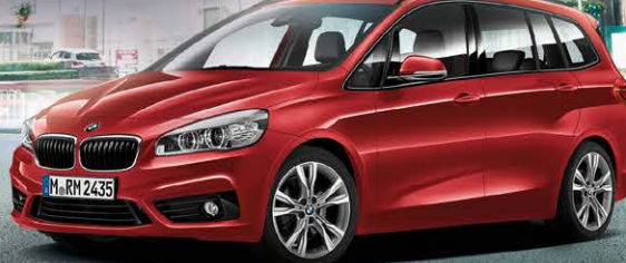
BMW 218i SPORT GRAN TOURER.

48 MONTH PERSONAL CONTRACT HIRE AGREEMENT.