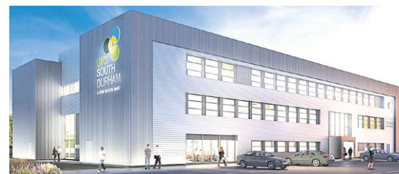
New Aycliffe UTC opening in September

WANTED Household furniture. Tel 07860 560295 WHEELCHAIR wanted. Tel 07956 089630