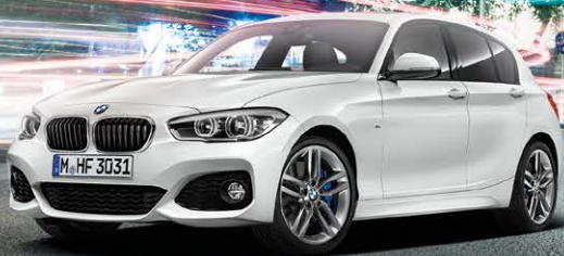
BMW 118i SPORT 5 DOOR SPORTS HATCH.