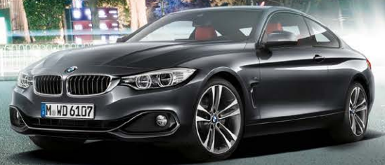
BMW 420d M SPORT COUPÉ.

48 MONTH PERSONAL CONTRACT HIRE AGREEMENT.