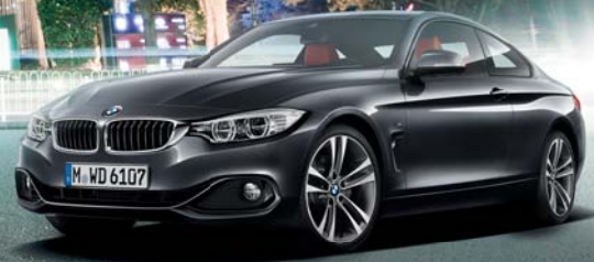
BMW 420d M SPORT COUPÉ.

48 MONTH PERSONAL CONTRACT HIRE AGREEMENT.