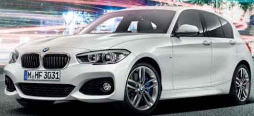
BMW 118i SPORT 5 DOOR SPORTS HATCH.