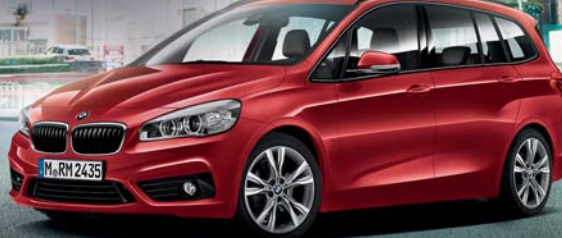
BMW 218i SPORT GRAN TOURER.

48 MONTH PERSONAL CONTRACT HIRE AGREEMENT.