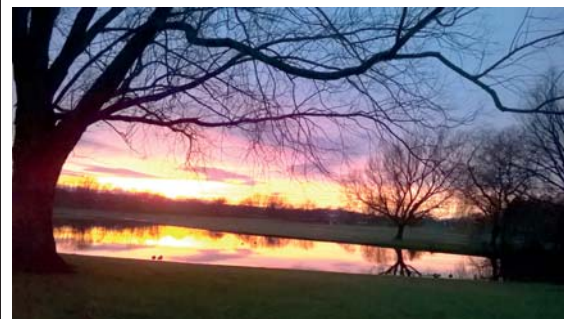
Photograph taken of boating lake, early evening on 17th February by Fiona Constantine