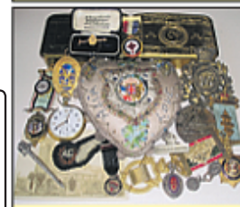
All Small Collectors Items