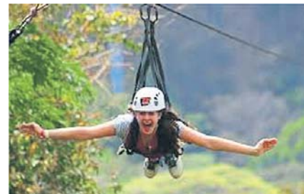
Zip Wire and Bungee Junping are popular outdoor activities