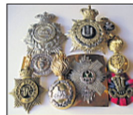
Head Dress Badges