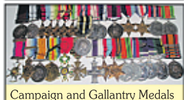
Campaign and Gallantry Medals