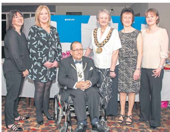
Mayor and Consort with the staff of Barclays Bank