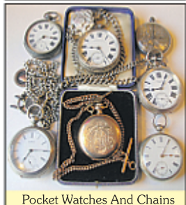
Pocket Watches And Chains