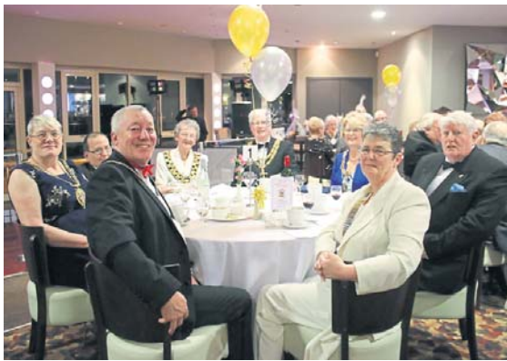
Top Table guests with Mayor and consort

DOUBLE DIVAN bed, 4 drawers, 18 months old, foam mattress,. £250. Tel 01325 490107 (eves)