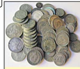
Pre 1947 Silver Coins