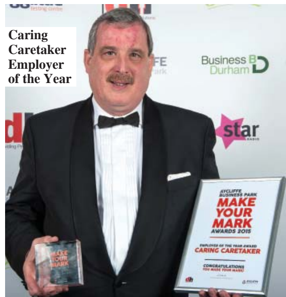
Caring Caretaker Employer of the Year