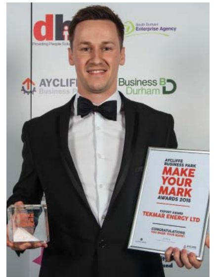
Tekmar Energy Ltd - Export Award