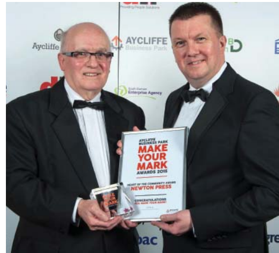
Newton Press - Heart of the Community