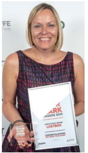
LostBox Innovation Award