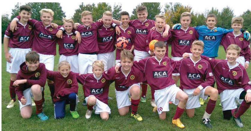
Newton Aycliffe Junior Under 14's Team