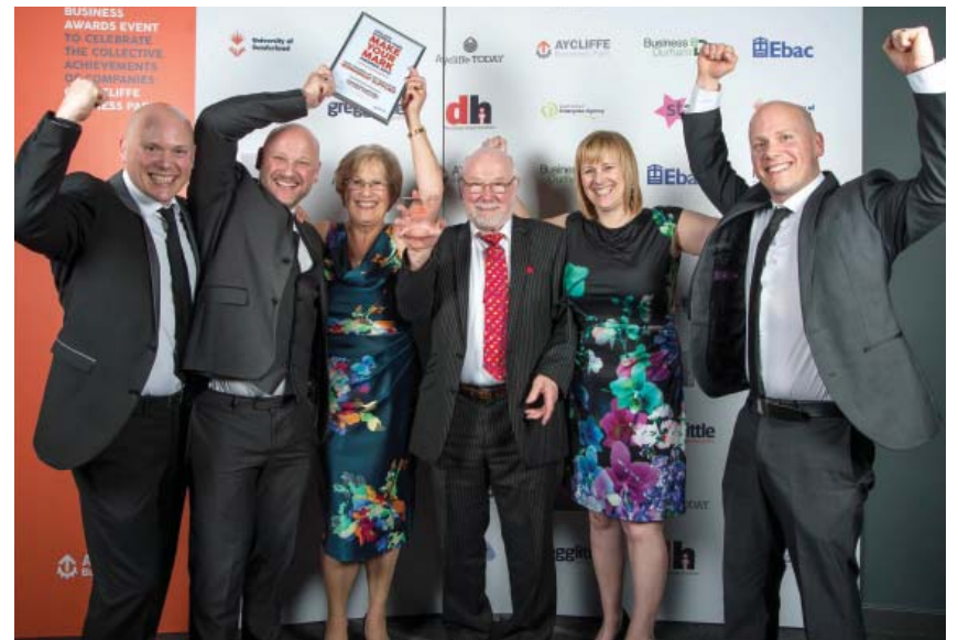
Workshop Suppliers - Small Business of the Year