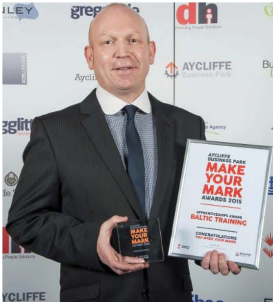
Baltic Training - Apprenticeships Award