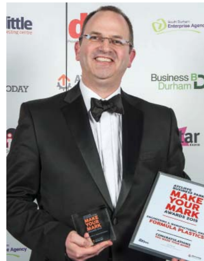
Formula Plastics Engineering & Manufacturing