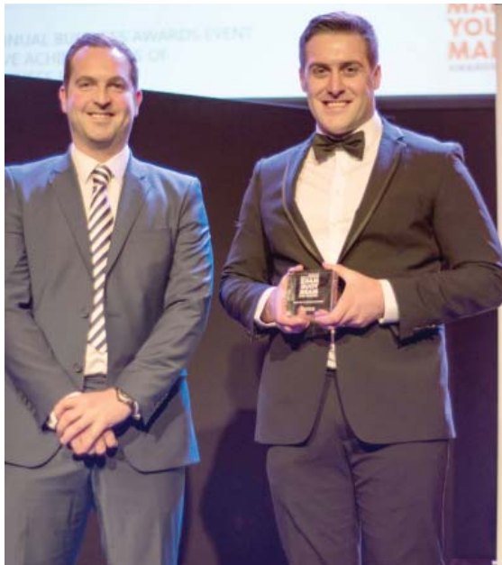
Beaumont Grounds Maintenance Service Business of the Year