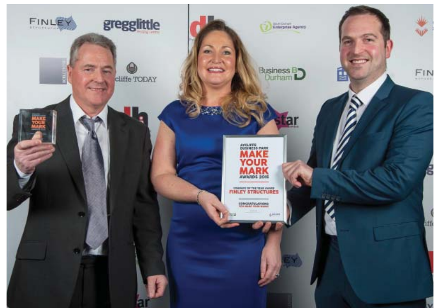
Finley Structures - Company Of The Year