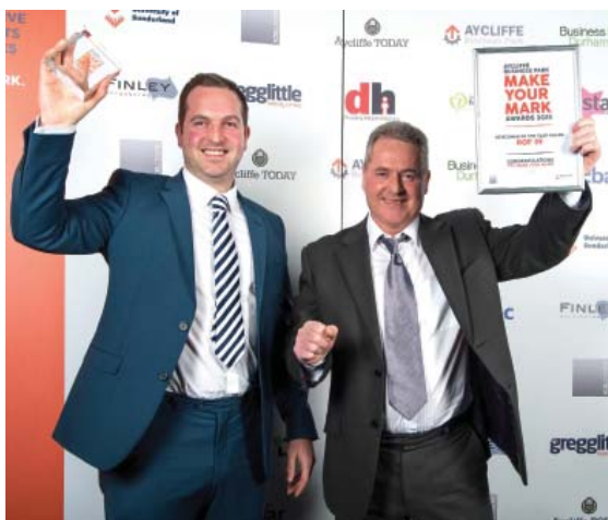
ROF 59 - Newcomer Award