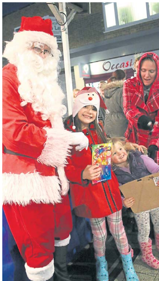
Santa arrived to hand out free gifts to children