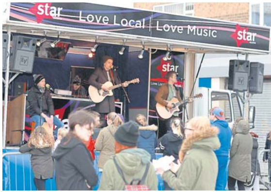
Local group "North Road"