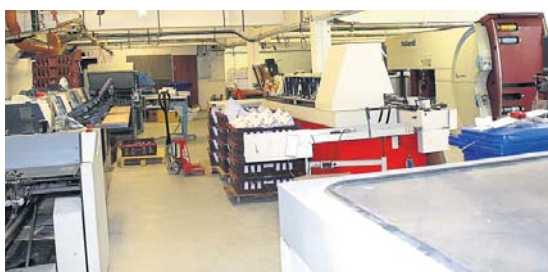
Ground floor of Newton Press Printworks

Advertising/Distribution: paul@newtonnews.co.uk