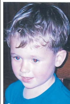
Happy 21st Birthday 6th July 2015 Lots of love from all of the family