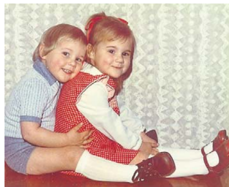
Happy 40th Birthday 9th July 2015 Lots of love from Mam

Advertise your Personal advertisements from 15p per word