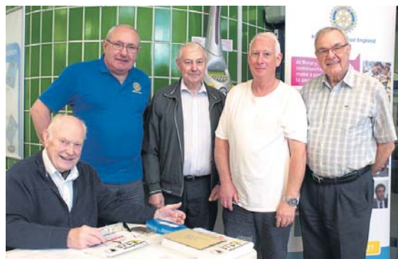
Members of Rotary and Lions at the reception area