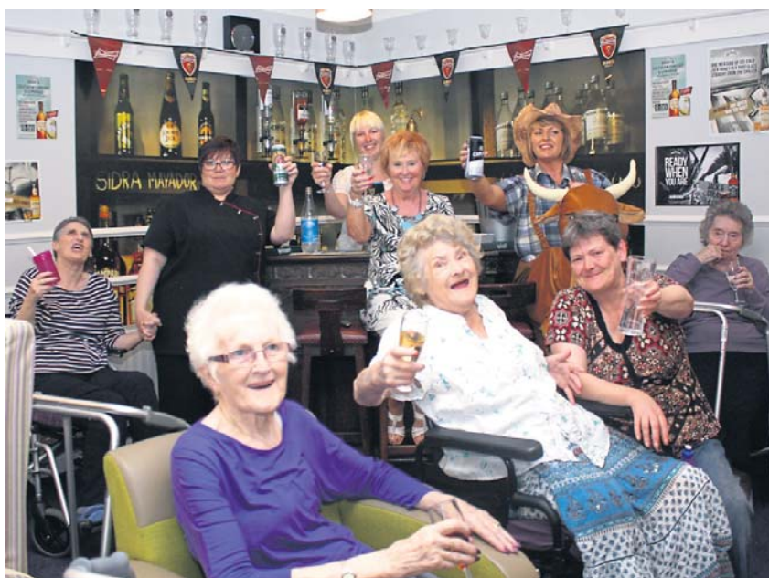
Residents of Rose Lodge Care Home toast their new on-site bar

The party was in full swing at Rose Lodge Care Home as they hosted the official opening of their newly installed bar. It was a real knees up as residents, staff and families enjoyed a tipple from the fully-stocked bar and a sing-along on the karaoke.