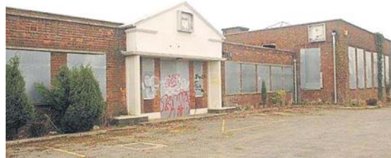
Former facade of Presswork Metals

to work there, so we have deliberately retained much of the original brickwork and signage within the building. "The plan is to create a permanent memorial, and help us to keep educating young people about this important piece of British history.