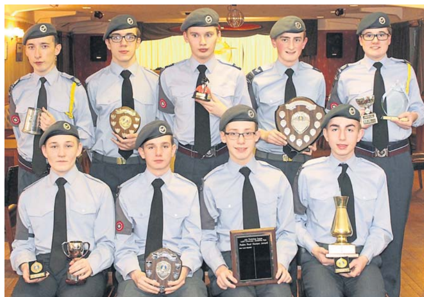
1407 (Newton Aycliffe) their annual presentation Squadron ATC recently held evening. The squadron