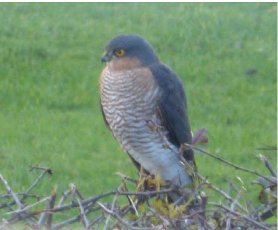
Sparrow Hawk looking for its tea