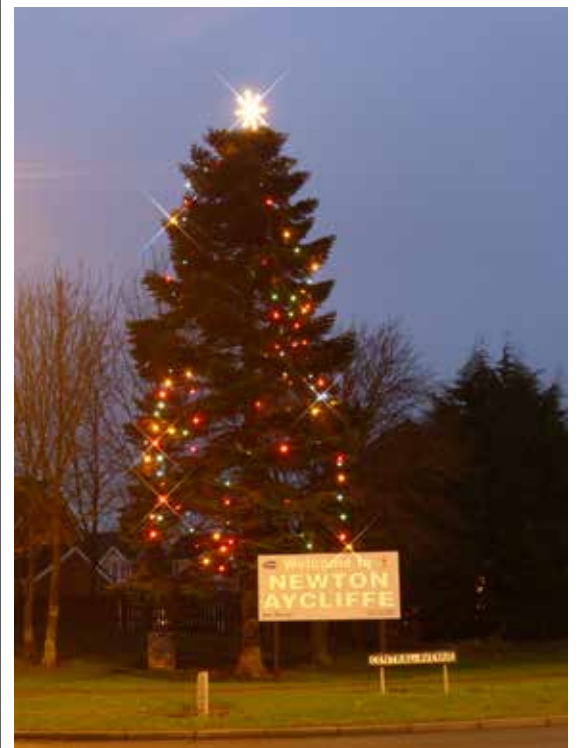
A welcoming festive sight to all who enter the town.