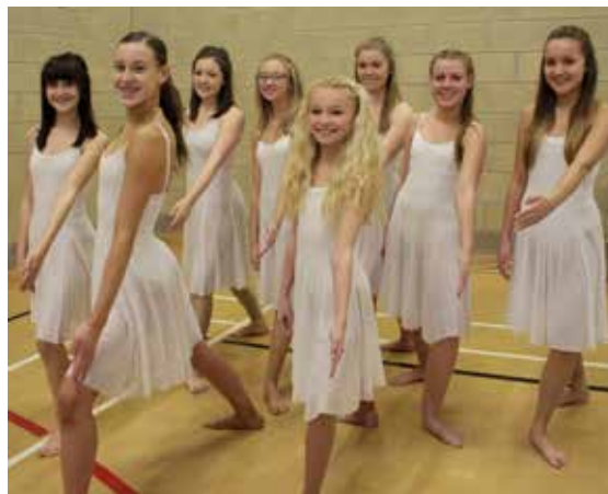
Dance Group from Greenfield College will perform

Schools taking part include Sugar Hill, Woodham Academy, Vane Road, Greenfield, St. Joseph's,