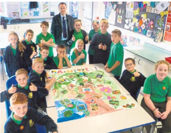
For the past 5 weeks a group of