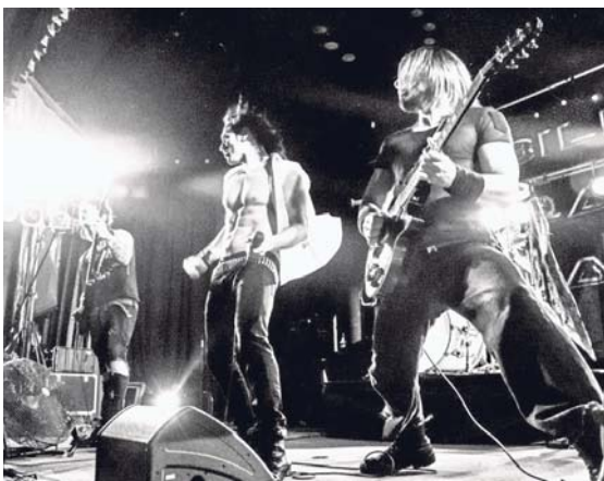
Newton Aycliffe Leisure Centre will host its first