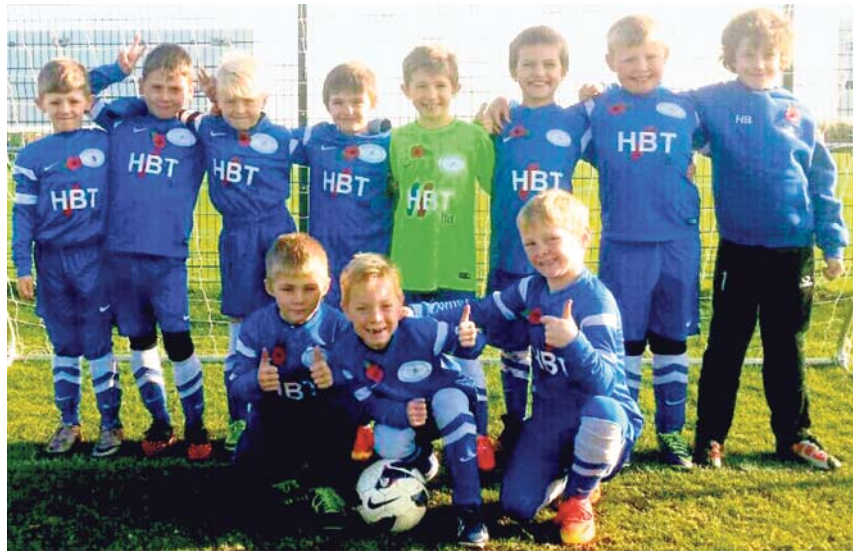
Newton Aycliffe Under 8 Falcons paid respect by wearing poppies and holding a one minute silence before their game on Remembrance Sunday which they won.