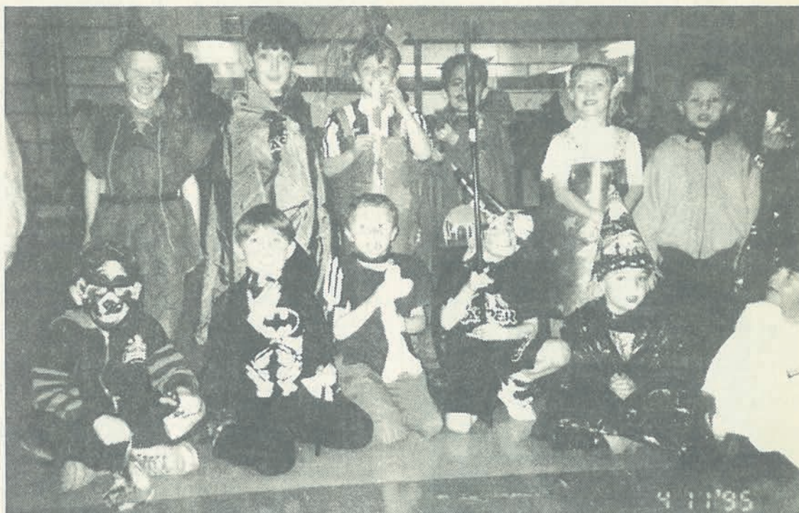
Some of the Byerley Park School pupils showing off their costumes at their recent Halloween/Bonfire Night disco arranged by the "Friends of Byerley Park"