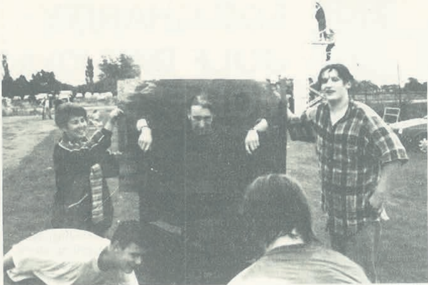
Some Senior Youth Centre members used the sticks to settle old scores!

No not the new Heavy-weight Boxing Champion, but local dog hero, who saved a life by barking wildly for help when his master was gripped by a seizure.