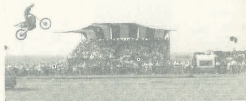
Stuntworld displaying their skills on the show field of the Great Aycliffe Show