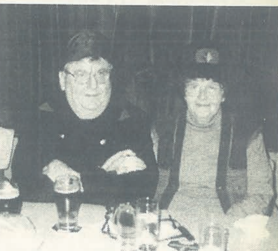
Do you recognise this couple getting in the mood for V.E. Day? This snap was taken at a recent 'Dads' Army' function where guests were invited to come in 40/50's fancy dress.