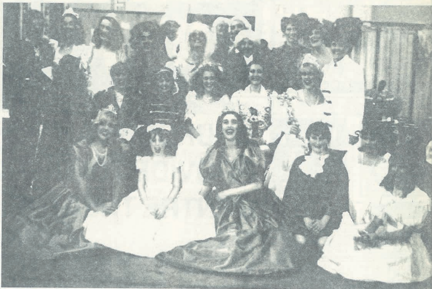
The cast of "Cinderella" presented by The Acorn Players

Dear Sir, Thank you, and very well done to the new group, the Acorn Players, for their most enjoyable show "Cinderella"