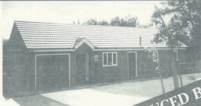
Bungalow Plot No. 46