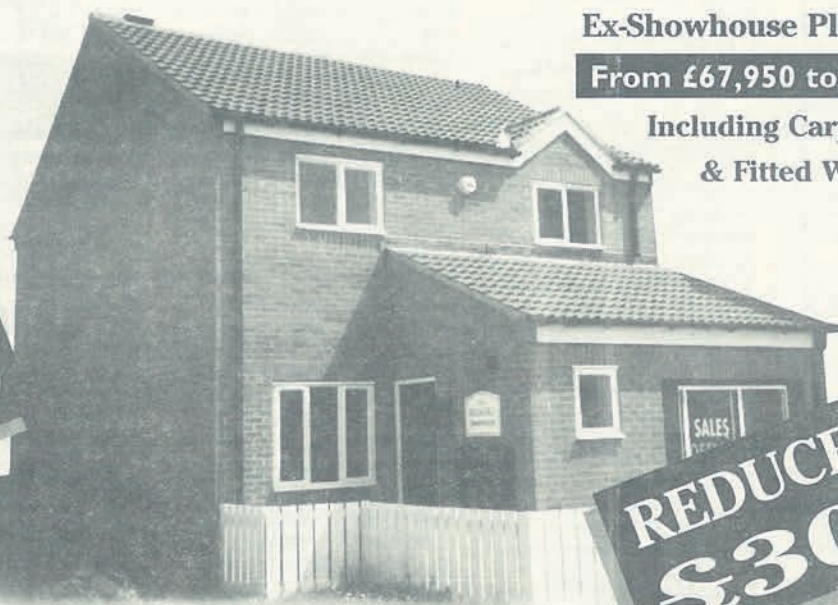
Ex-Showhouse Plot No. 56