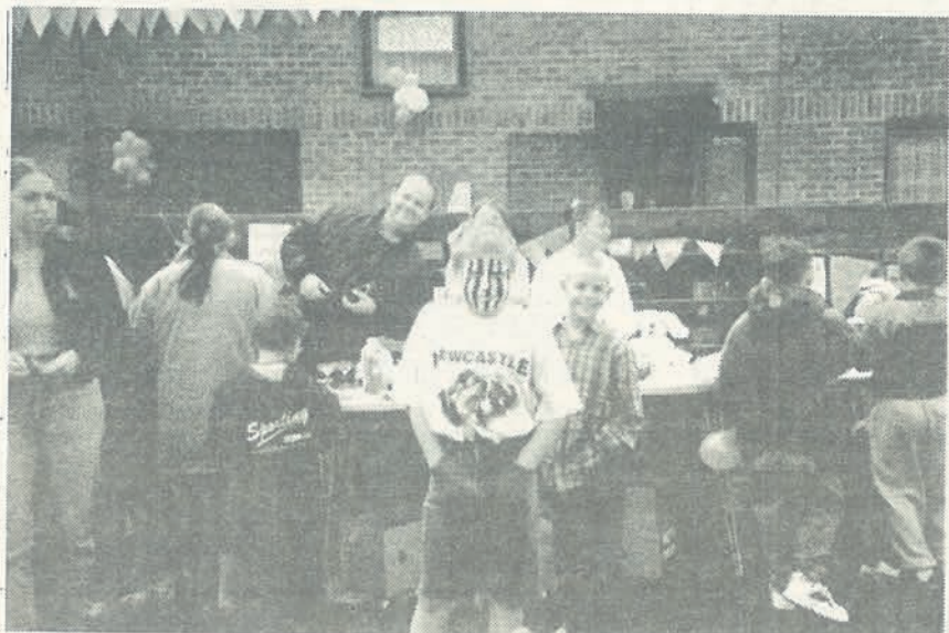
The fortune teller attracted great interest