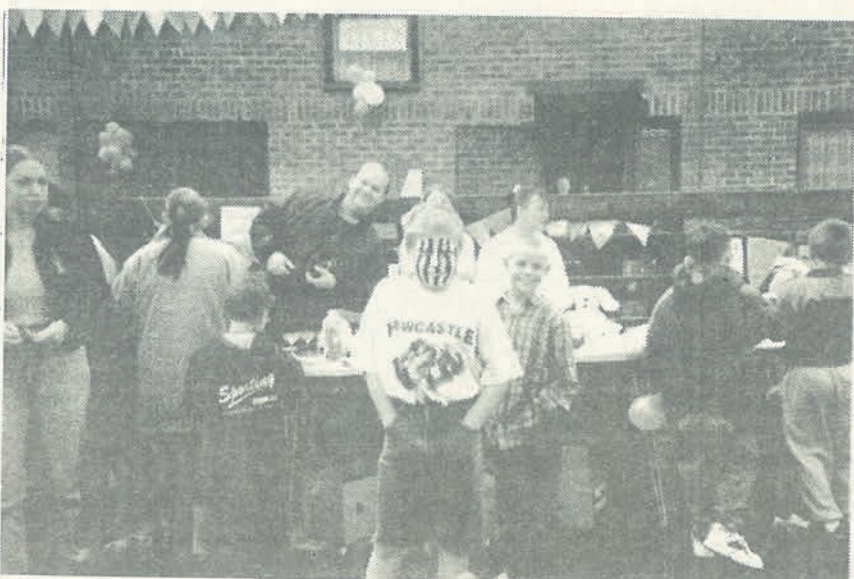
The fortune teller attracted great interest