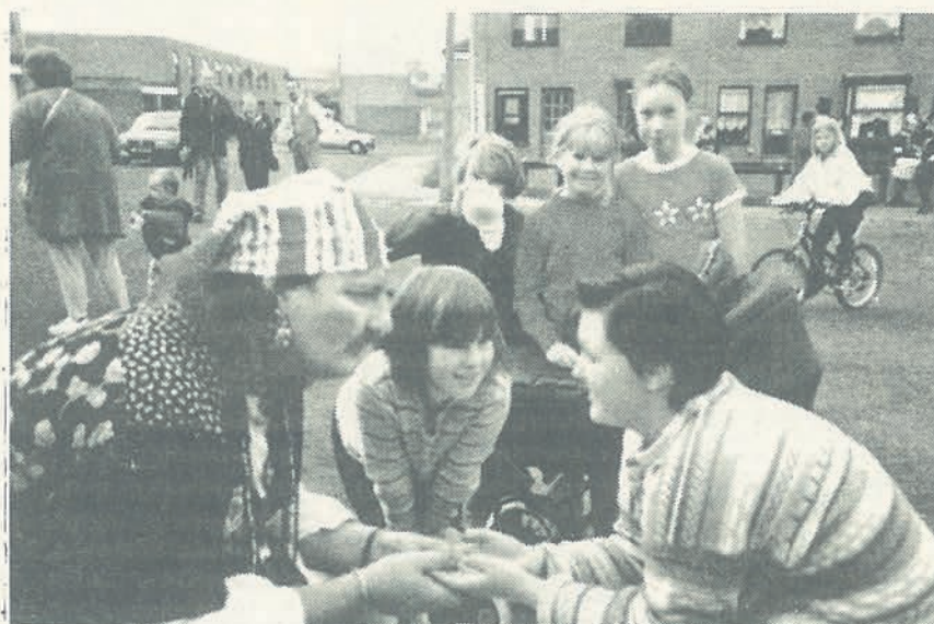
A busy Street scene at the Fun Day