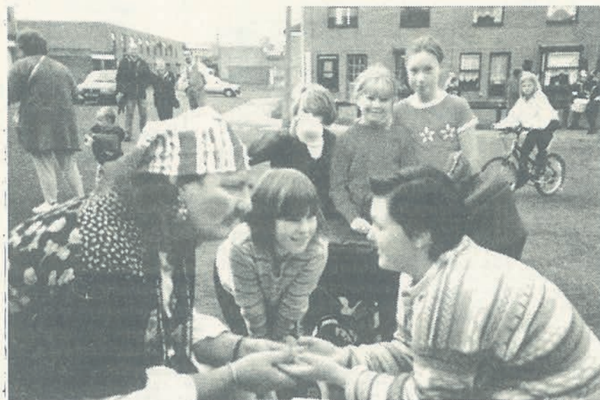
A busy Street scene at the Fun Day