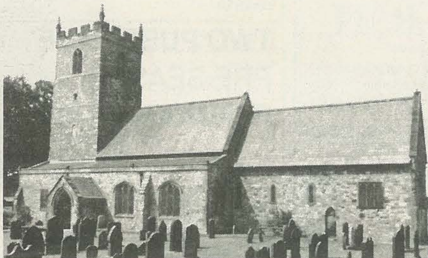
St. Andrews Church, Aycliffe Village

The Parishes of Newton Aycliffe and Aycliffe Village have been re-united as the new Parish of GREAT AYCLIFFE. The new Parish has two Parish churches of St. Andrew's and St. Clare's; together with the churches of St. Francis, Horndale and St. Elizabeth, Woodham.