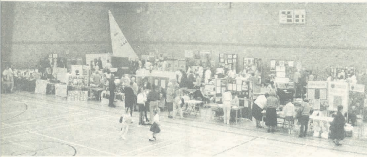
The Exhibition Hall before the crowds arrived