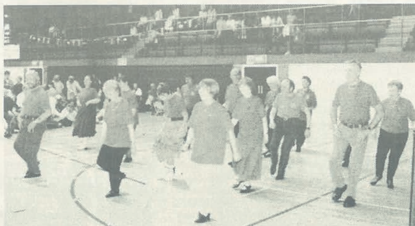
Line Dancing was interesting and entertaining