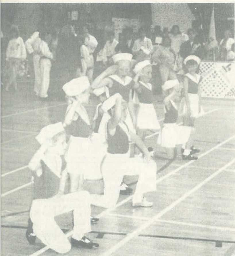
Colourful entertainment by the Jacques-Hargreaves Dancing School