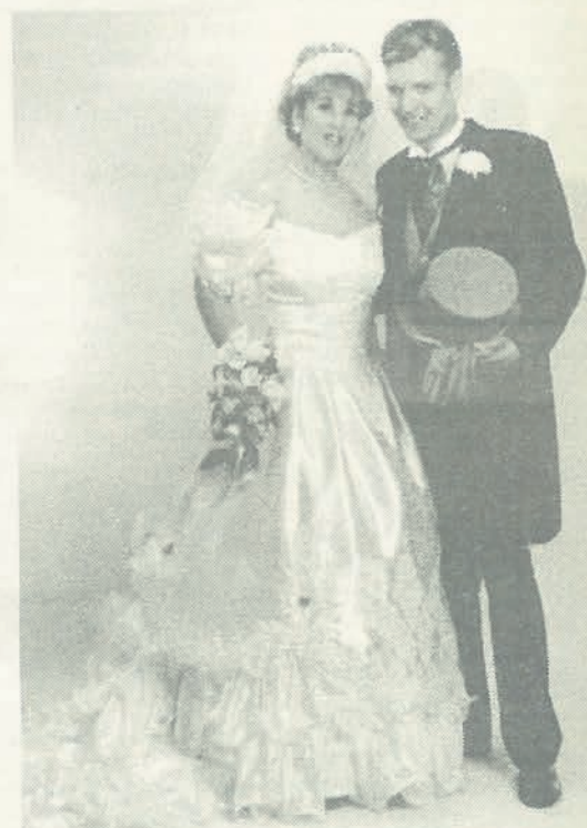
Today, attired as they would have wished

"My Dream was to wear a Wedding Dress half the size of my original - and it came true"