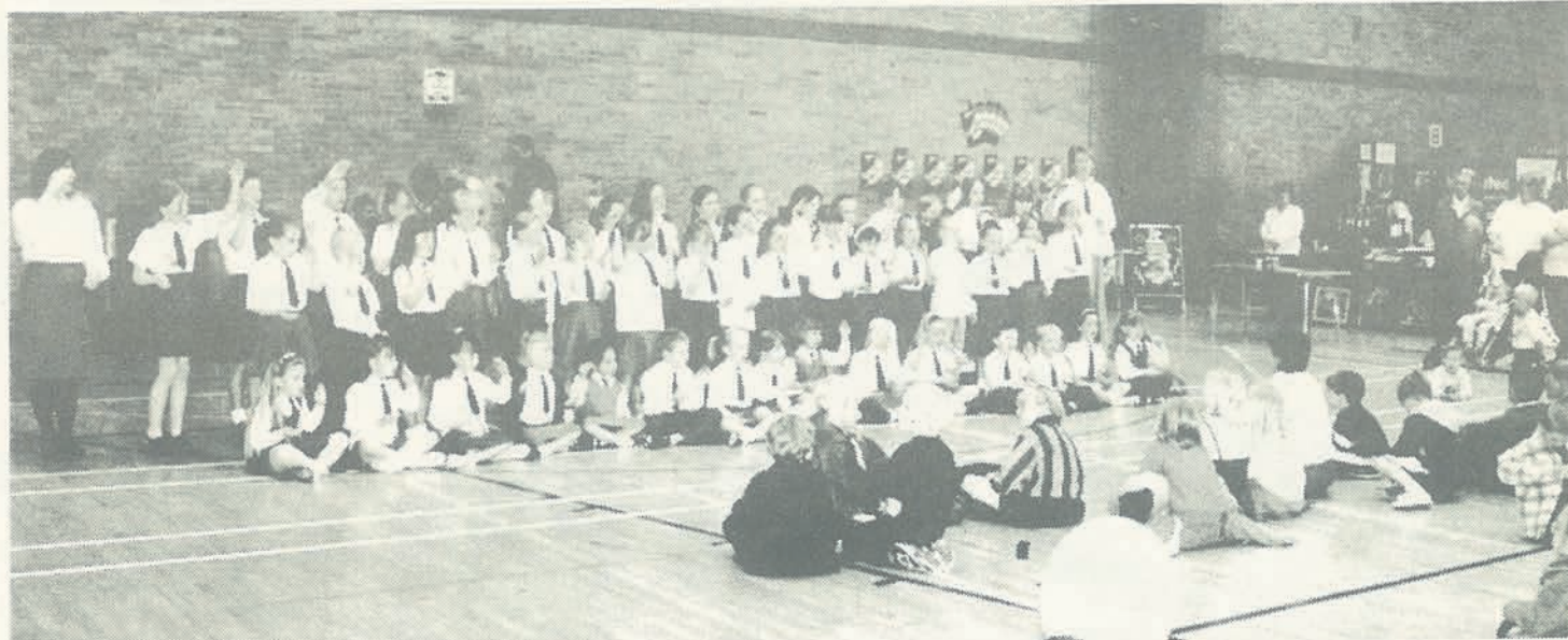
Sugar Hill School pupils demonstrate Sign Language for the Deaf to music