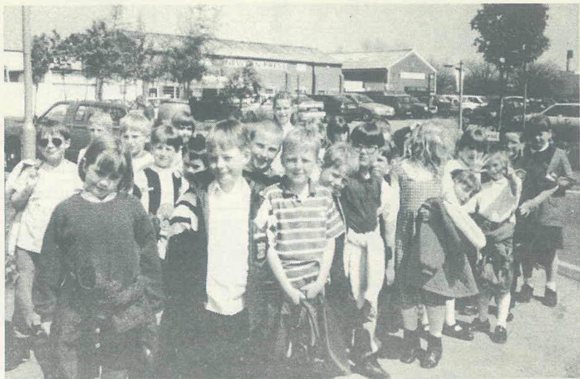
Photo: The children outside Newton Press.

The two essays are the winning entries from the two classes which visited Newton Press on Tuesday 14th and Wednesday 15th May