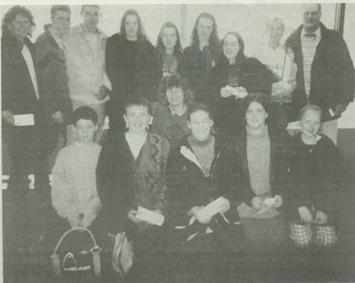
A group of Students and Teachers visited Bucharest taking numerous items of toys, clothing and stationery etc. to a Hospital and an Orphanage