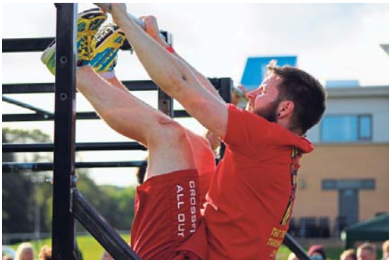
View more images from this event on our website

was immense. Everyone has worked so hard this year and this was our first big event outside of the gym - so being one of the youngest CrossFit boxes there, we were extremely proud of how well our athletes did. It was a great achievement and we look forward to many more in the future."