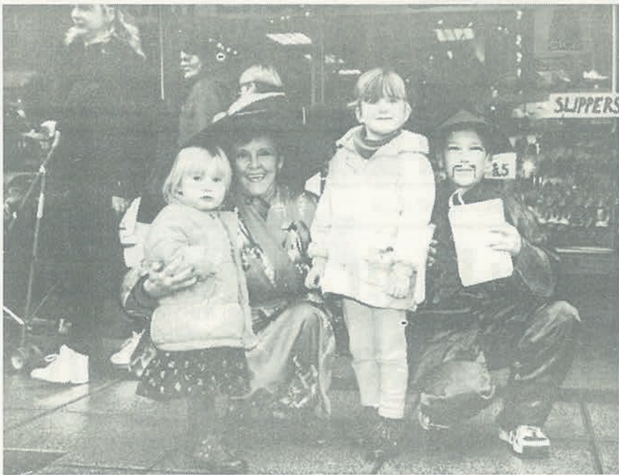
The Acorn Players are presenting Aladdin at Woodham Comprehensive School from Wednesday 25th to Saturday 28th November 1998, starting at 7.15pm. Tickets: £3 Adults / £2 Concessions. Tickets NOW being sold. Discounts also available for Block Bookings. Please ring 01325 311816 or call in at Elliotts Shoe Shop, Newton Aycliffe. Photo shows Widow Twanky with Aladdin outside Elliotts promoting the Panto.