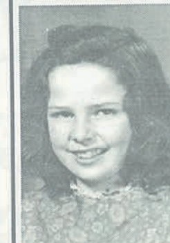
Sept., 27th 1958 Hip hip hooray our boss is 40 today. Happy birthday from The Gang at Boyes