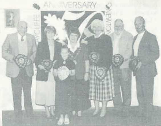
Craft winners with their Trophies