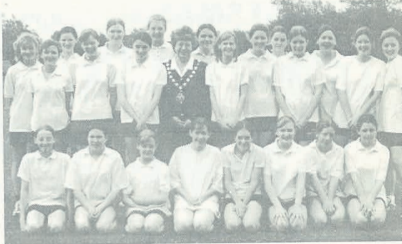
Sports Day at Woodham Comprehensive School