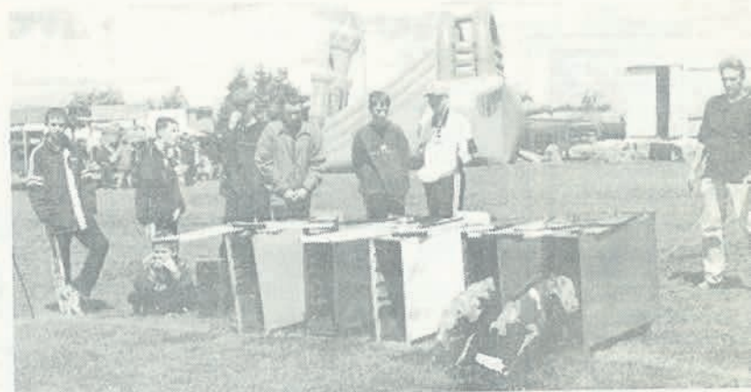
Whippet Racing on the Show Field