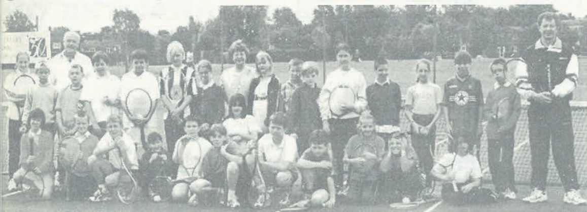
Above: Greenfield School Junior Tennis Coaching held at Simpasture Park Courts Left: Street entertainers in the Town Centre Below: Country & Western Nite