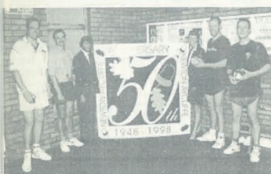
Squash Tournament Winners