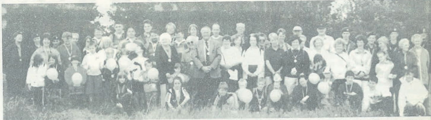
Walkers assemble at the start of their Sponsored Walk along the new Great Aycliffe Way