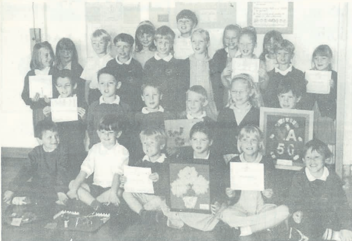
The children from Vane Road Primary School won eight prizes in total in the Handiwork and Craft Section at the Great Aycliffe show. The children's ages were between 4 and 7 years old and they won over £30 to be spent on art equipment. All staff from the school are delighted at the children's success.