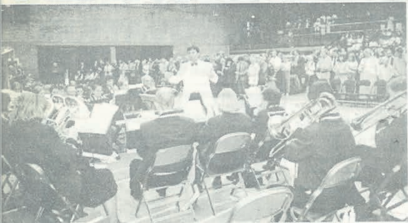
Our Town Band were in great form at the Civic Service