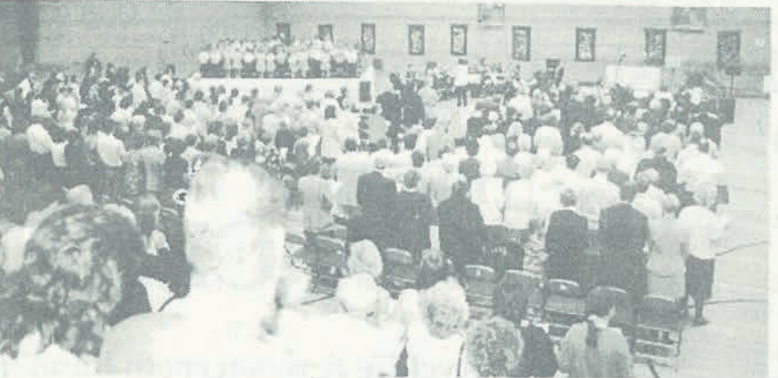
The Civic Service held in the Leisure Centre

On the 50th birthday of Newton Aycliffe many people took part in this year's Show making it a super finish to a week of celebrations. Every age group from Pre-School Learning Centres to the elder members of our community helped to make the Show a huge success.