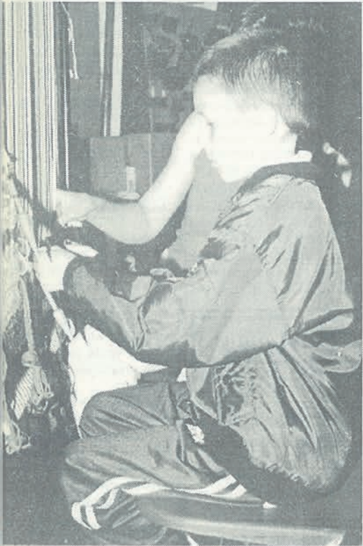
Weaving Tapestries in the Craft Marquee