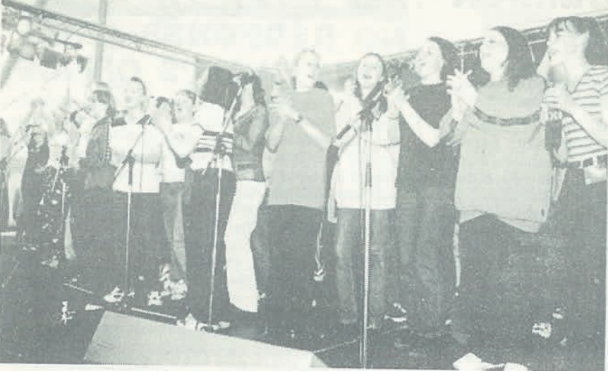
Young entertainers in the Music Marquee