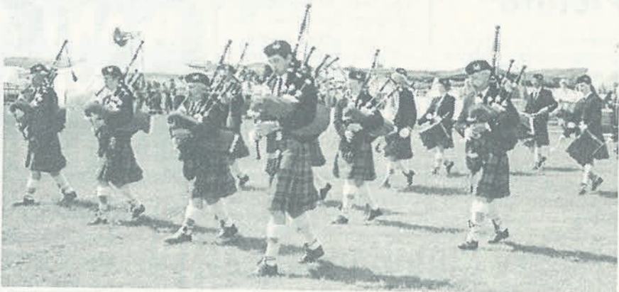
Pipes & Drums entertain at the Showground