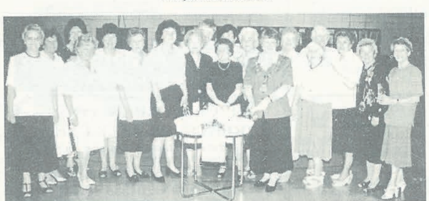
Tea Dance in the Sports Complex.