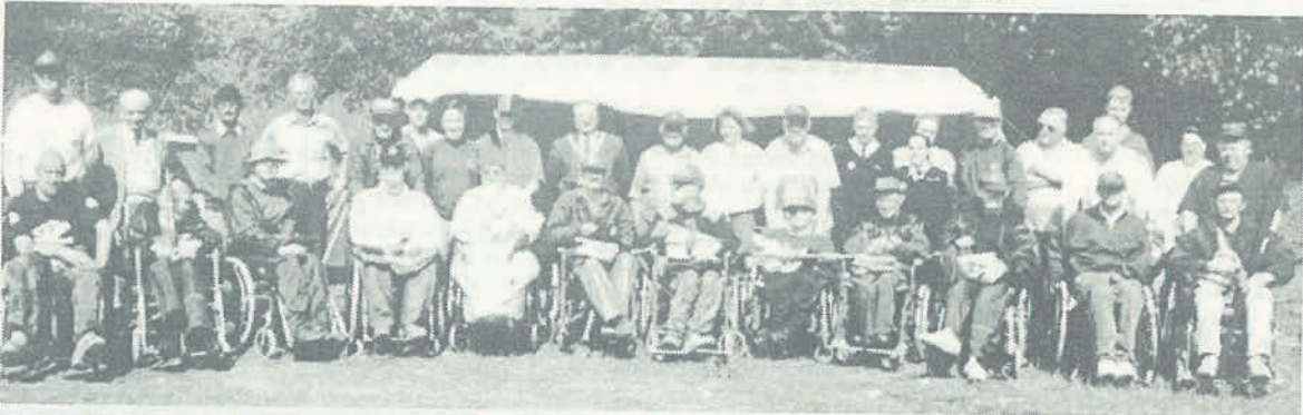
The Angling Club held a day of Fishing specially organised for disabled people