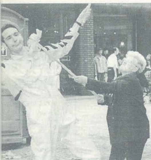
Town Centre Entertainment

Unclaimed Prizes (NO Ticket / NO Prize) Yellow - 86 159 328 Green - 224 396 328 White - 9 175 176 186 A big thanks to all who helped us and leaders who donated prizes. Yours Sincerely All the children and leaders of Newton Aycliffe YOC - The Biggest Wildlife Club in the World.