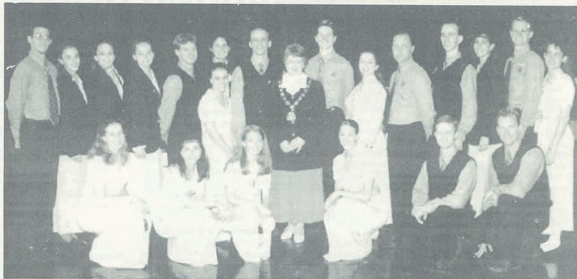
The Brigham Young University Ballroom Team gave a "Master Class" at Woodham Comprehensive School