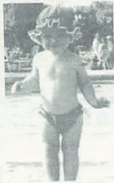
11th June 1998 "Isn't she lovely?" All my love and best wishes on your 21st - Dad