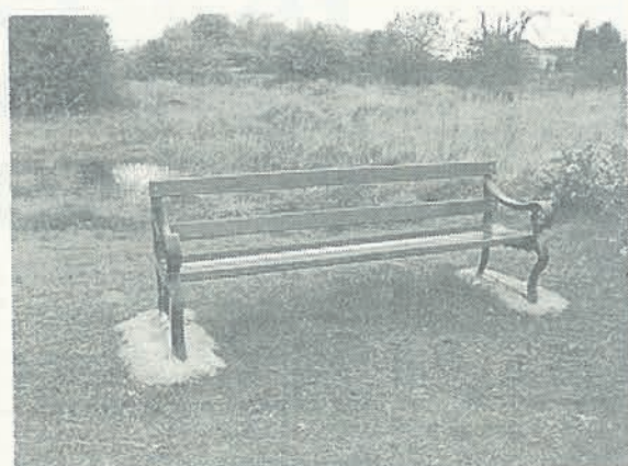
1 of 2 benches donated by Great Aycliffe Town Council