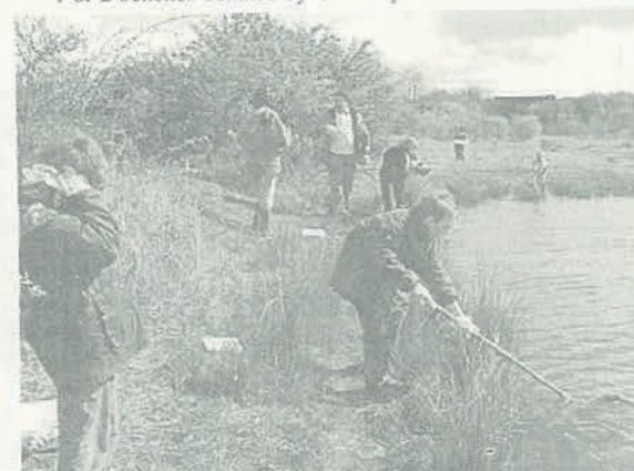
YOC Pond-Dipping at Aycliffe Nature Park